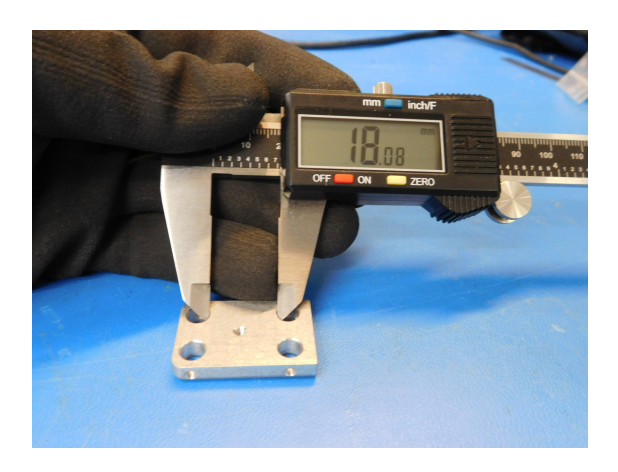
Figure 3: Dimension 06

To find the critical dimensions of this part all we need is a set of calipers. Important to note that when taking the distance from a hole, as seen in Figure [3], we need to make sure we remember to add the radius of each hole that we are referencing.