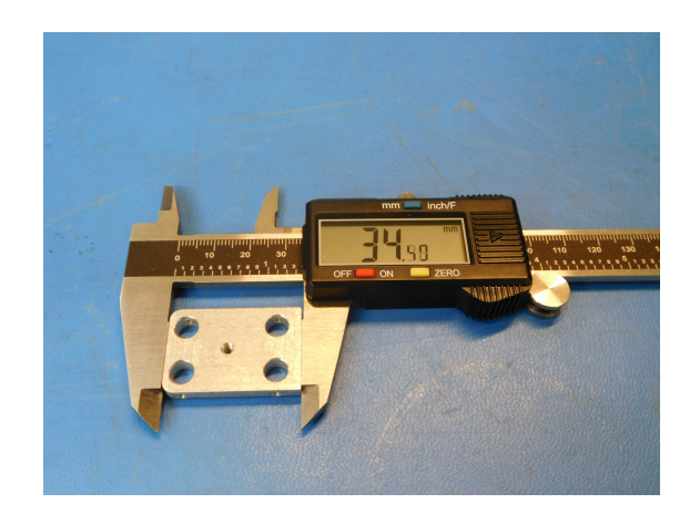
Figure 2: Dimension 01.