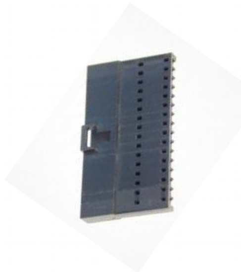
1x Male 16pin Housing [PC-CN0057]

Note: Unless otherwise specified All cable length +/-3mm Jst strip length +/-0.25 Molex strip length +/-0.5