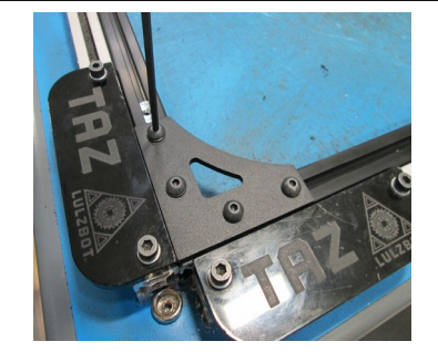
500mm/ 510mm frame alignment